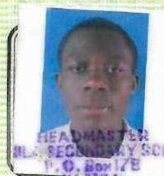
HEADMASTER MUNANILA SECONDARY SCHOOL P.O. Box 178 KASULU E.E.123

THE UNITED REPUBLIC OF TANZANIA MINISTRY OF EDUCATION AND VOCATIONAL TRAINING