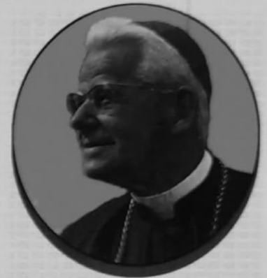
CARDINAL JOSEPH CARDIJN 1882-1967 INSPIRER OF YCS