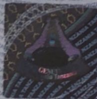
Chief Executive Officer